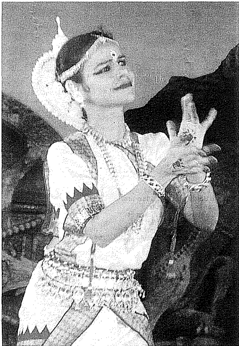
Gentle elegance: A sophisticated artist gives a performance of Odissi dance, the cultural pride of the Indian state of Orissa